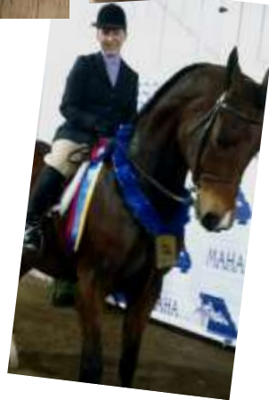
Packing the Trailer for a Show...